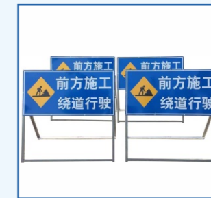
反光膜 Reflective film