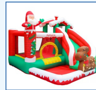
气模喷绘 Inflatable Inkjet