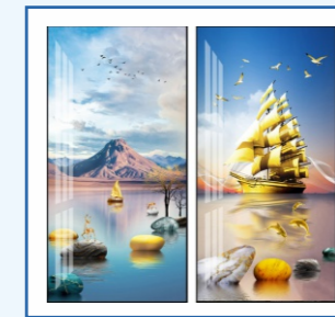
装饰画 Decorative Paintings