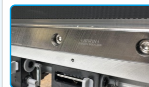
进口HIWIN导轨 Imported HIWIN Guide Rail

铝合金加厚一体小车架，小车可整体升降，方便使用。 Aluminum alloy thickened trolley frame, the integrated trolley can be up and down, which is very convenient.