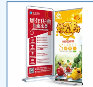
广告展架 Advertising Display Rack