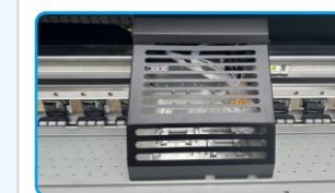
铝合金小车架 Aluminum Alloy Frame

升降式铝合金墨栈架，智能化全自动清洗维护喷头。 Lifting aluminum alloy ink stack, intelligent automatic cleaning and maintenance of the printhead.