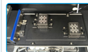
铝合金墨栈架 Aluminum Alloy Ink Stack

高品质工业电机传动系统，保障设备打印的精度及稳定性。 High-quality industrial motor drive system ensures the accuracy and stability of equipment.