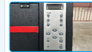
中英文按键面板 Chinese and English Key Panel

恒定墨水液位压力，有效防止打印断墨。 Constant ink level pressure, effectively prevent ink broken when printing.