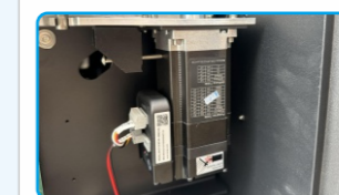
伺服电机 Servo Motor

国内高端板卡系统，稳定性好、故障率低、经久耐用。 The domestic high-end board system has good stability, low failure rate and durability.