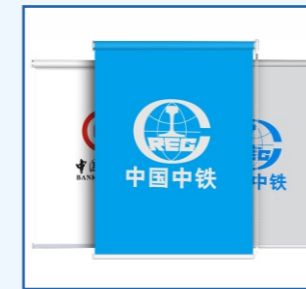
窗帘卷帘 Curtain Roller Blinds