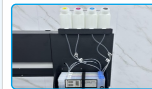
连供墨盒系统 Continuous Cartridge System

双弹簧高密度压纸轮，走纸更精准，拆卸简单，可单独更换压轮。 High-density press rollers with double-spring, paper feeding is more accurate, disassemble easily, and the press rollers can be replaced separately.