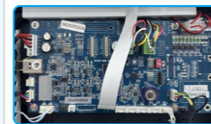
汉森板卡 HOSON Board

国内高端板卡系统，稳定性好、故障率低、经久耐用。 The domestic high-end board system has good stability, low failure rate and durability.