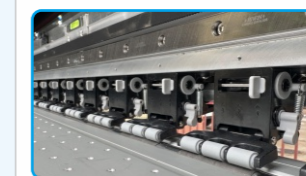
高密度压纸轮 High Density Press Roller

采用进口HIWIN静音直线导轨，保障设备高精度平稳运行，使用寿命更长。 Imported HIWIN silent linear guide rails ensure the printer with high-precision and stable operation and a longer lifespan.